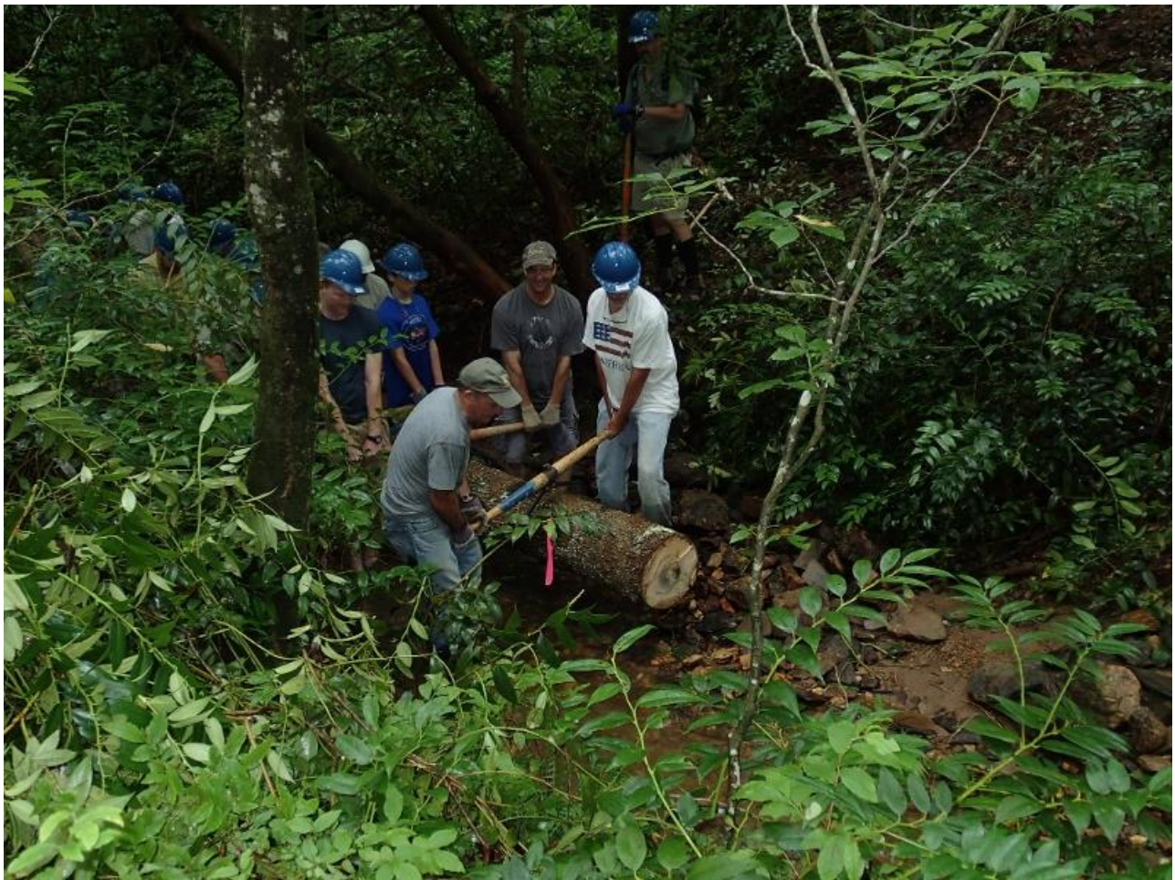
This is how the pyramids were built! (Moving a log for a brook trout structure on Martin Branch)