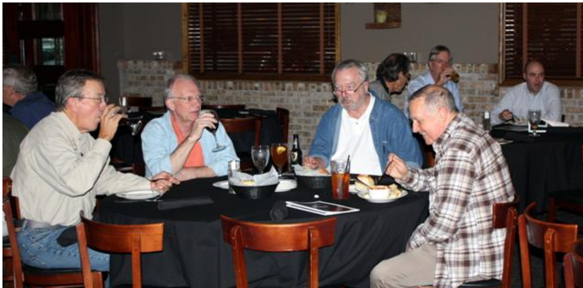
Enjoying food and drink at Ippolito's